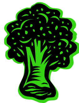
HAVE A GREAT SUMMER!

Don't forget to vote! One vote can make a difference.