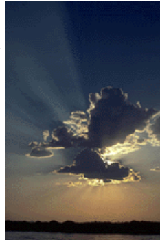
Open House December 6, 2007 1:00-6:00 p.m.