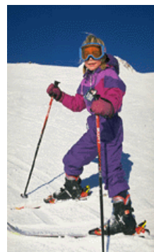
Please read about new voting requirements.

Voters who do not bring picture identification to the polls or do not possess picture identification can vote like any other voter by signing an affidavit. Questions regarding the picture identification requirement can be directed to your local city or township clerk's office.